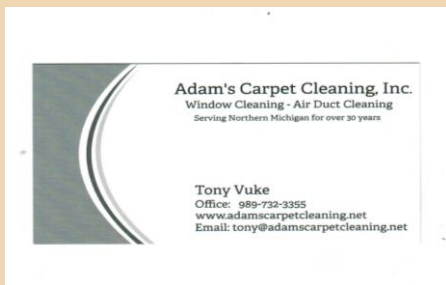
Endorsed by 2 EFPOA Residents!