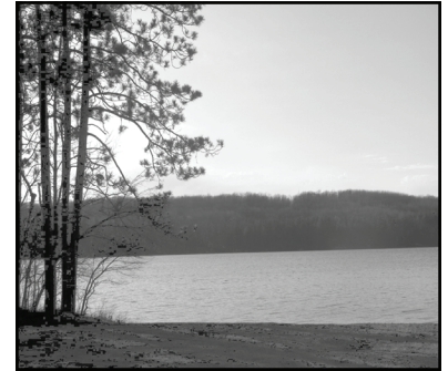
Summer days are just around the corner

Remember to check our website at www.efpoa.com for updates on activities, board meetings, meeting minutes, treasurer's reports and much more. Suggestions for improving the information on our website are always welcome!